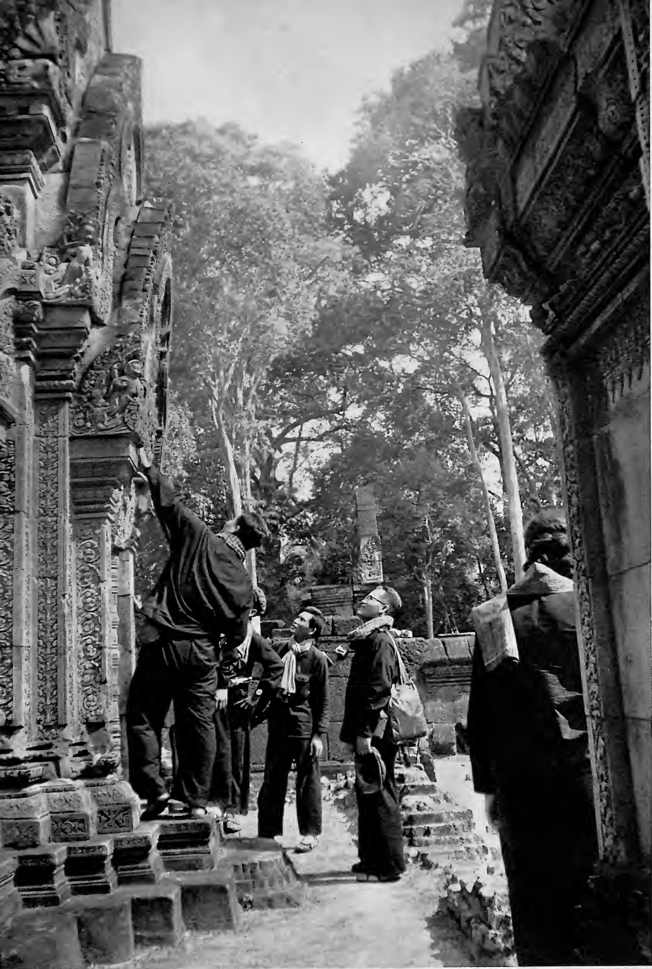
Patriotic leaders of the Khmer Resistance Movement in the interior delighting in the exquisite national cultural heritage.